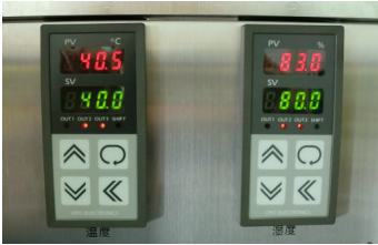
Temperature and Humidity Control Range Diagram